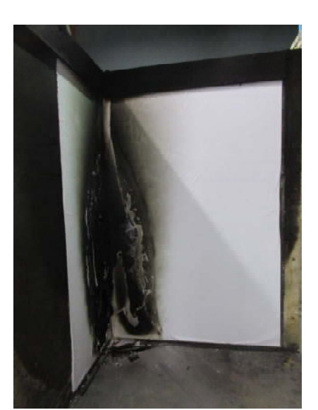
After Test (EN 13823)